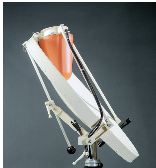
Microwave Directional Antenna AC008 collapsed for transport